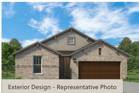
Exterior Design - Representative Photo