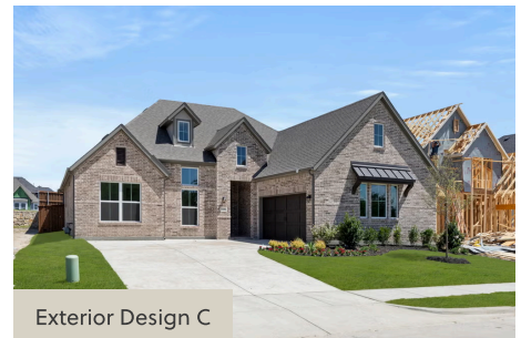
Exterior Design C