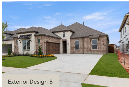
Exterior Design B