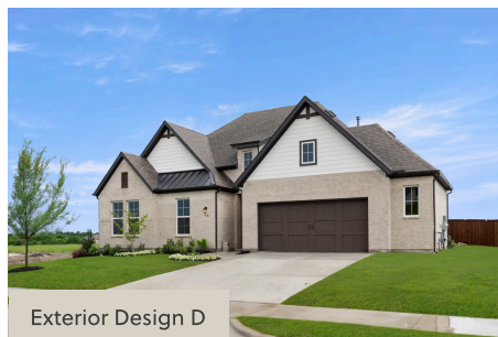
Exterior Design D