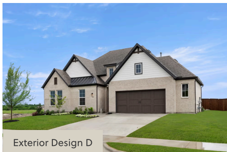
Exterior Design D