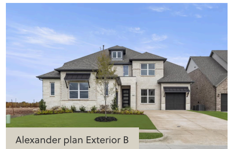
Alexander plan Exterior B