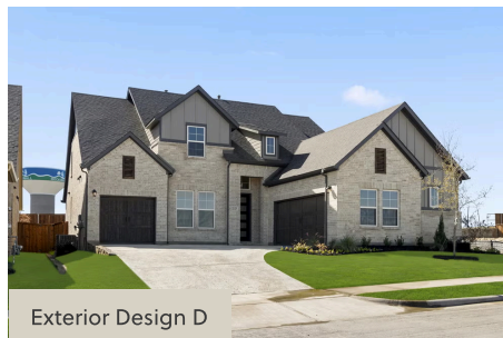
Exterior Design D