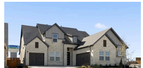
Exterior Design D