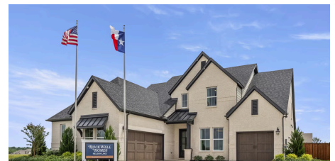
Alexander Plan by RockWell Homes Rockwall TX