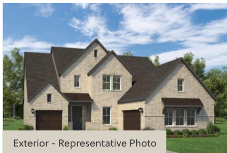
Exterior - Representative Photo