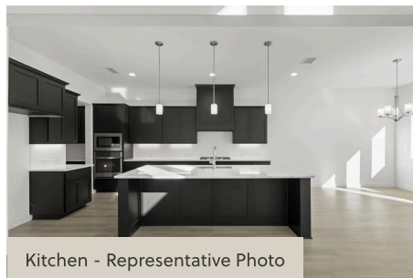
Kitchen - Representative Photo