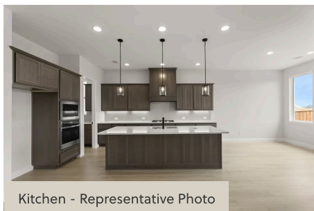
Kitchen - Representative Photo