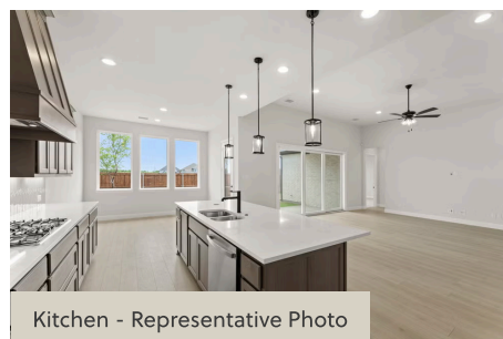
Kitchen - Representative Photo