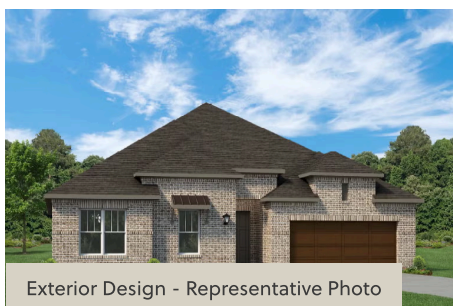
Exterior Design - Representative Photo