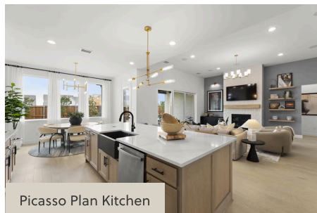
Picasso Plan Kitchen