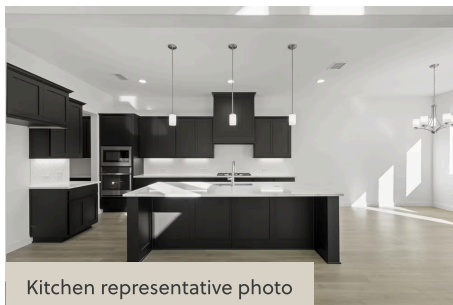
Kitchen representative photo