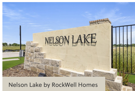
Nelson Lake by RockWell Homes