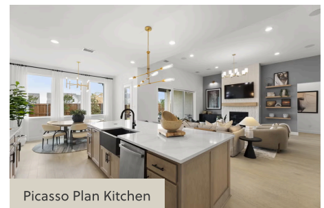
Picasso Plan Kitchen