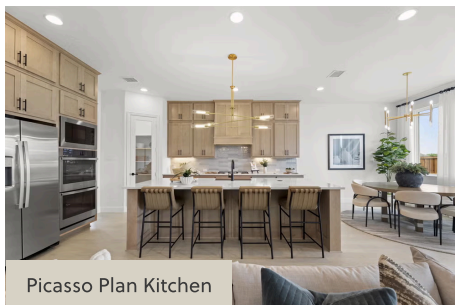
Picasso Plan Kitchen