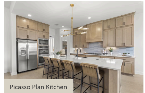
Picasso Plan Kitchen