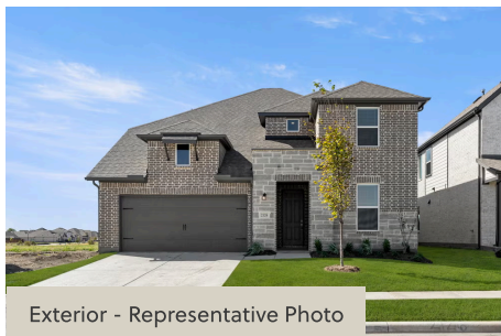
Exterior - Representative Photo