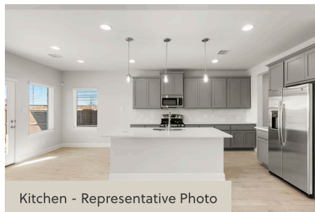
Kitchen - Representative Photo