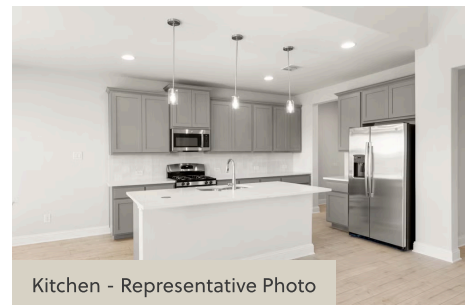
Kitchen - Representative Photo