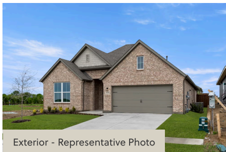
Exterior - Representative Photo