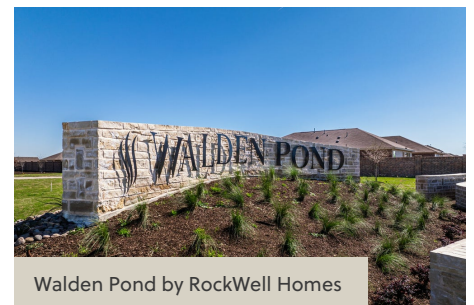
Walden Pond by RockWell Homes