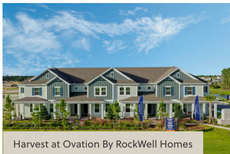
Harvest at Ovation By RockWell Homes