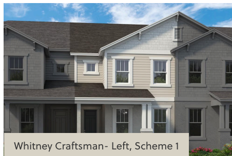
Whitney Craftsman - Left, Scheme 1