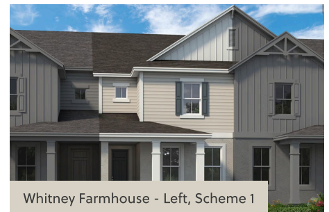
Whitney Farmhouse - Left, Scheme 1