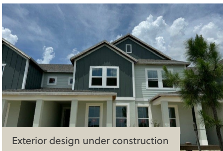
Exterior design under construction