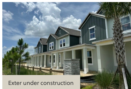
Exter under construction