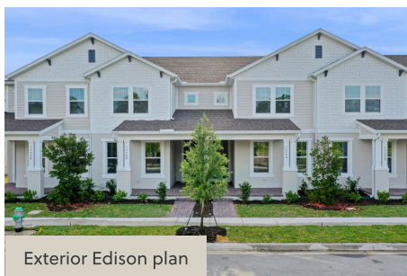
Exterior Edison plan