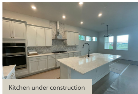
Kitchen under construction